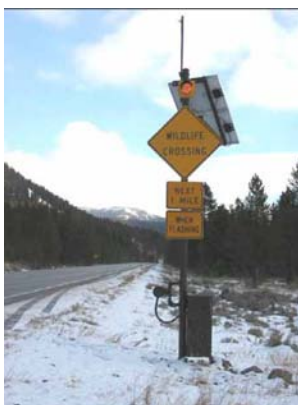
Figure 1. Montana Enhanced Wildlife Warning Sign. (Inserted from Referenced Report)

During this phase of the study the Montana ADS was improved and enhanced wildlife warning signs were installed. First, the “blind spots” (i.e., areas where the beam was blocked and detections did not occur) noted above were reduced to from 10.6 percent (approximately 1,115 feet) to 1.09 percent (approximately 115 feet) of each side of the one-mile roadway test segment. In addition, some general repairs were conducted on the system and an access road was created for maintenance and research personnel. Once all the repairs were completed, four enhanced wildlife warning signs (see Figure 1), two in each direction, were installed along the test segment (see Figure 2). After the system installation was completed and operating correctly its speed and crash reduction effectiveness were evaluated.